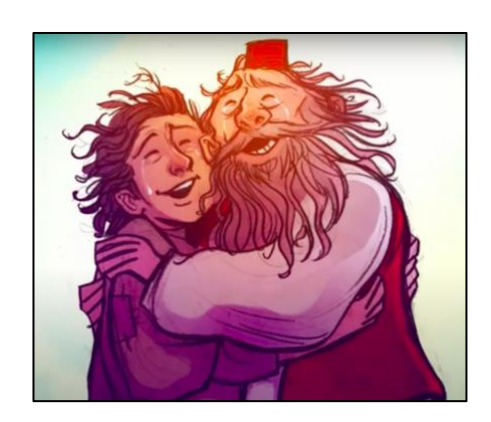
PARABLE OF THE PRODIGAL SON (LUKE 15:11-32)

Video: https://youtu.be/yB MXdBMx4-U (3:29) by Sharefaith