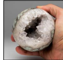
Activity: Open a GEODE