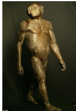
HOW LUCY APPEARS IN TEXTBOOKS & MUSEUMS

Paleontologists are always looking for the “Missing Link” between apes and humans. One of the most famous finds is “Lucy” ( Australopithecus afarensis .)