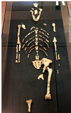
ACTUAL LUCY FOSSILS FOUND