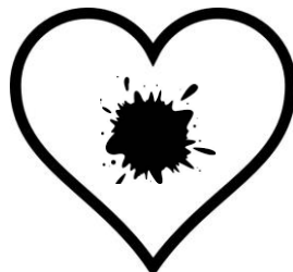
Heart with sin