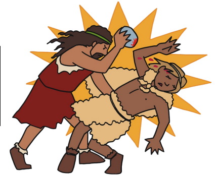
Lesson #4: CAIN AND ABEL (Genesis 4:1-16, 25)

Video: <u>https://youtu.be/yKi_LSrXVJI?si=i4v</u> <u>_1IWguFCLTtek</u> Cain and Abel by KidVue.org (3:10)